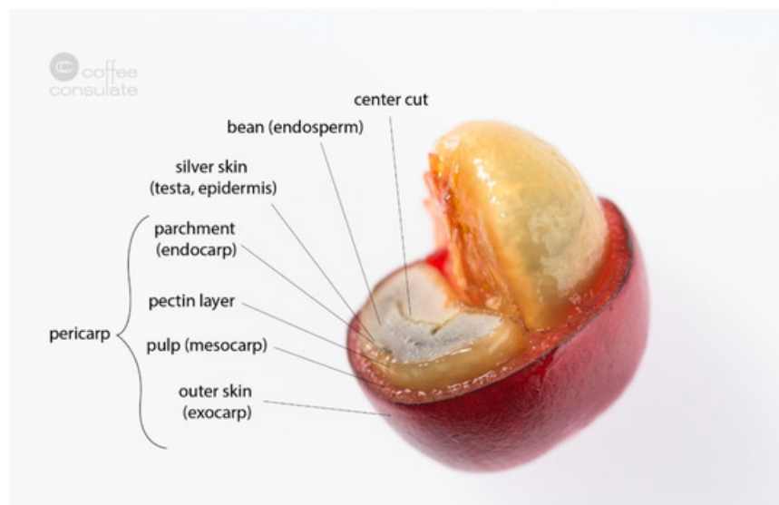
Figure 1. Cross section of a coffee cherry with its different layers.

remaining silver skin still adhering to the beans accrues as waste [5] . Spent coffee grounds are another type of waste produced either by coffee consumers or by the industrial production of instant coffee [1] . As a result, a large quantity of by-products is generated during the production of coffee, and their recycling is becoming more and more important. Parts of the coffee plant such as flowers, leaves, twigs and wood are equally classified as coffee by-products, because they arise during cultivation. The most important by-products for food production are listed in Table 1.