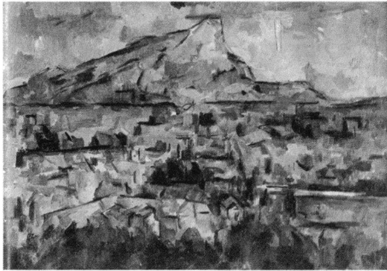
Figure 3. Cézanne’s “Mont Sainte-Victoire” [11].

Merleau-Ponty repeatedly used words such as “ambiguity” [16][17] or “obscurity”, and “depth”. Merleau-Ponty mentioned that all experience is ambiguous. These words represent a situation in which reversibility (material/immaterial, visible/invisible, and internal/external) is intertwined in space. Merleau-Ponty’s understanding derives from this chiasm, especially from the relationship between visible and invisible. Rowe and Slutzky also stand at the same point with the phenomenal/literal transparency he tried to solve concerning architectural visible/invisible. Further, they investigated Cézanne’s “Mont Sainte-Victoire” (Figure 4) [15][11].