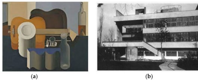
Figure 1. (a) Le Corbusier's work, “Still life”; (b) Villa Garches [11] .

develop a new form of perception but also remain in the artificial depths of space in terms of expression. Their idea of phenomenal transparency seems to be aimed at “a further level of interpretation” to be discovered in Cubism artwork. However, they overlooked some aspects of Cubism. From a phenomenological perspective, Cubism was an attempt to develop new forms of perception to overcome the limits of “the perspective of the Renaissance” [11] (p. 45). Cubism rejects the traditional techniques of perspective. The artificial depth of the Renaissance perspective was the main issue the Cubist painters wished to overcome. However, their representational ways for understanding Le Corbusier's Cubism work, “Still life”, were still defined by an artificial depth of space through an axis with the plane of the façade ( Figure 1a ).