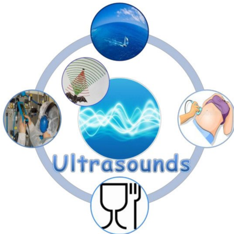
Figure 1. The different fields in which ultrasound (US) has been applied.

The fields in which US has been applied exploit both its mechanical and chemical effects. The importance of the two effects varies according to the frequency used [8]. At low frequencies (20–100 kHz), the mechanical effect caused by unstable cavitation predominates, and as the frequency approaches 20 kHz, the bubbles collapse with increasing violence [18]. At medium frequencies (200–500 kHz), the chemical effect is prevalent, as a greater number of bubbles form that collapse less violently. At high frequencies (>1 MHz), both the chemical and physical effects related to cavitation are minimal, while the effect of the acoustic flow is predominant. The high frequencies are typically used to clean delicate objects, which might be damaged in the presence of cavitation.