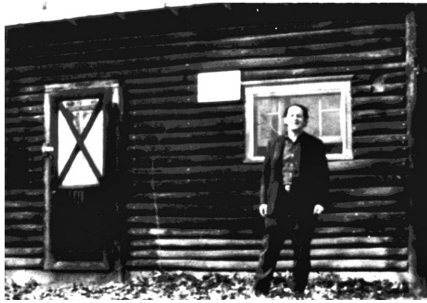
Figure 2. Eugene Garfield in front of the converted chicken coop in Thorofare, NJ, where he started the Science Citation Index.