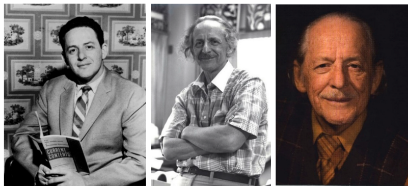
Figure 4. Pictures of Eugene Garfield, some of which accompanied his essays in Current Contents .