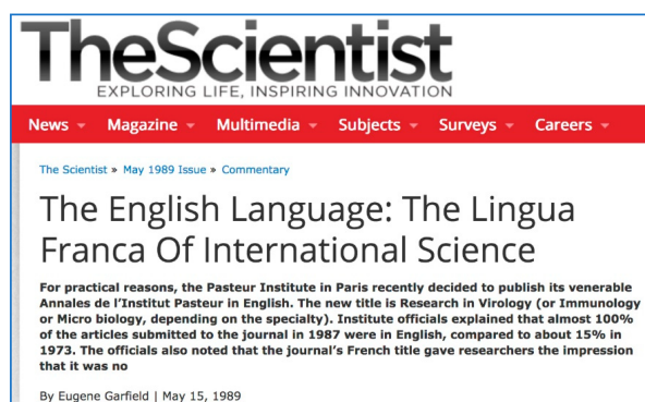
Figure 6. An article by Eugene Garfield promoting English as the international language of science published in The Scientist magazine.

Scientist were devoted to convincing the world that science needs a common language and that this language should be English (Figure 6). The selection of journals for the SCI and SSCI favors English-language journals, which has worked against content published in other languages.