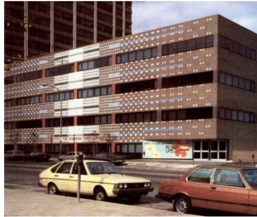
Figure 1. Institute for Scientific Information (ISI) at 3501 Market Street, Philadelphia.

scientific literature offered a new and more efficient way of collecting, analyzing, disseminating, and discovering scientific information. The SCI laid the foundation for building new important information products such as Web of Science (one of the most widely used databases for finding scientific literature today), Essential Science Indicators, and Journal Citation Reports. It triggered the development of new disciplines (such as scientometrics, infometrics, and webometrics ) and preceded the search engines, which use “citation linking”—a core concept of the SCI—to connect and rank documents. Some have called Garfield “The Grandfather of Google” . “Citation linking” was probably considered by Sergey Brin's and Larry Page for their article in which they mentioned Google for the first time. Many articles, books, conference presentations, and interviews discuss and analyze Garfield's ideas and legacy [1][2][3][4][5][6][7][8][9][10][11][12][13][14][15] .