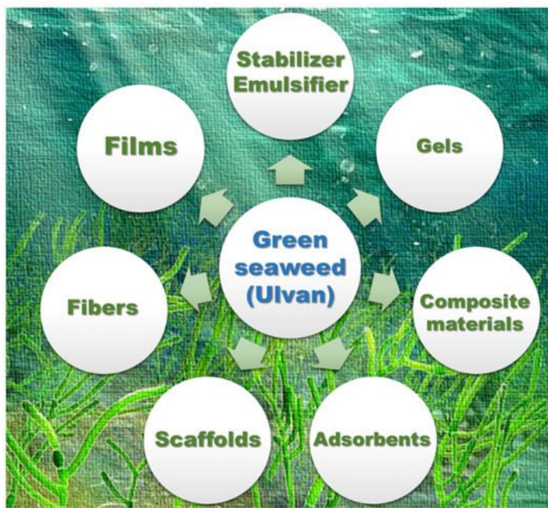
Figure 3. Possible bio-based materials using ulvan polysaccharides as a source.

Over the last decade, efforts have been attempted to improve life quality through biomaterials [58]. In general, ulvan polysaccharides are utilized for the preparation of certain biomaterials (Figure 3). In this section, ulvan-derived biomaterials along with their applications are summarized.