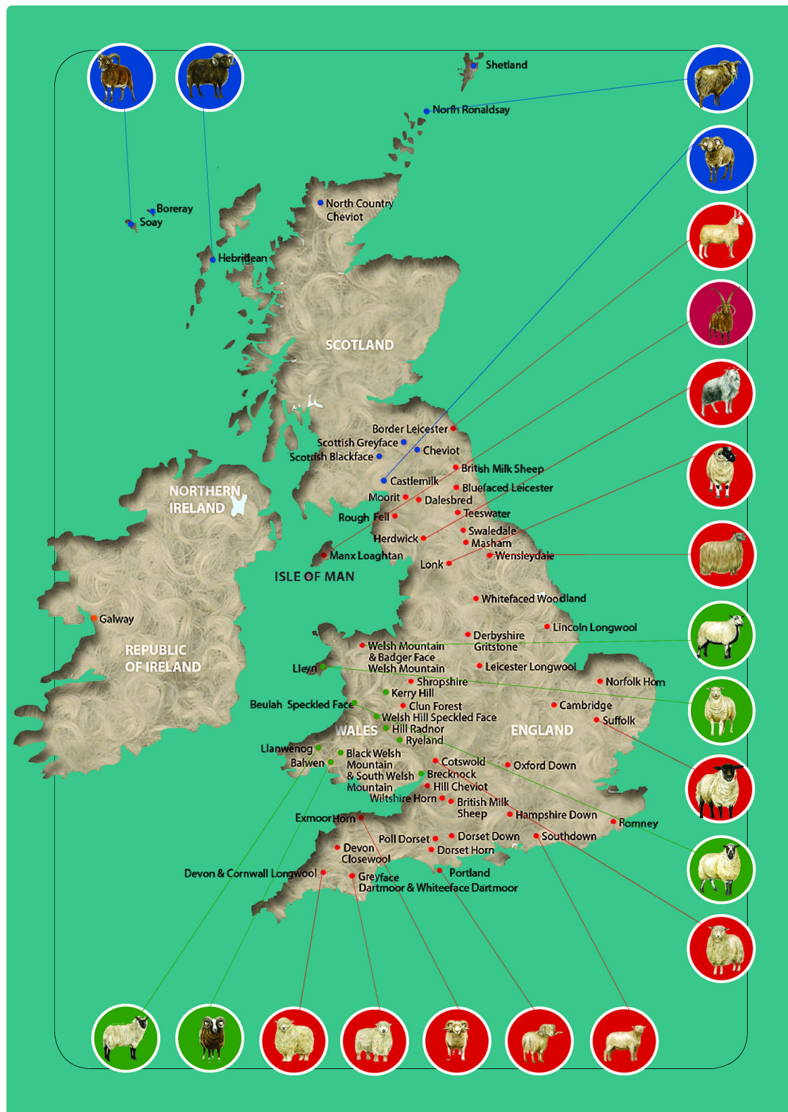
Figure 2. Geographical distribution of native sheep breeds in the British Isles. Modified from [6][7].

The geographical concentration (endemism) of the British sheep breeds was suggested to be a major risk factor for breed endangerment [8].