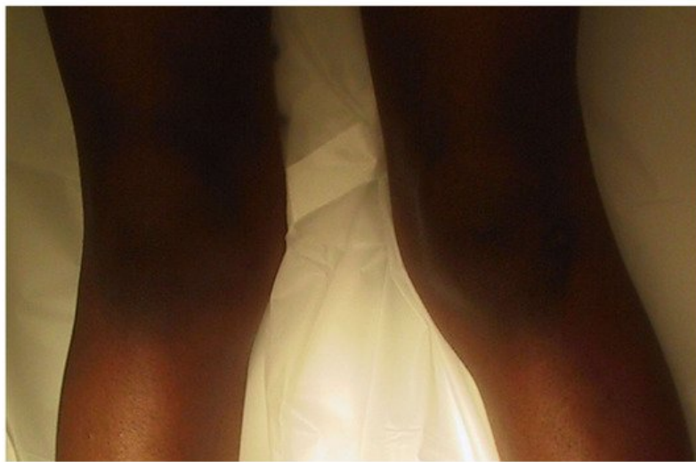
Figure 4. Negative Cover Up test demonstrating valgus alignment at the lateral knee indicative of physiologic genu varus.