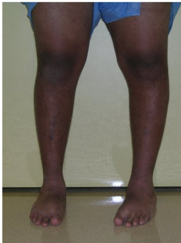
Figure 2. A 14-year-old with left-sided LOTV.