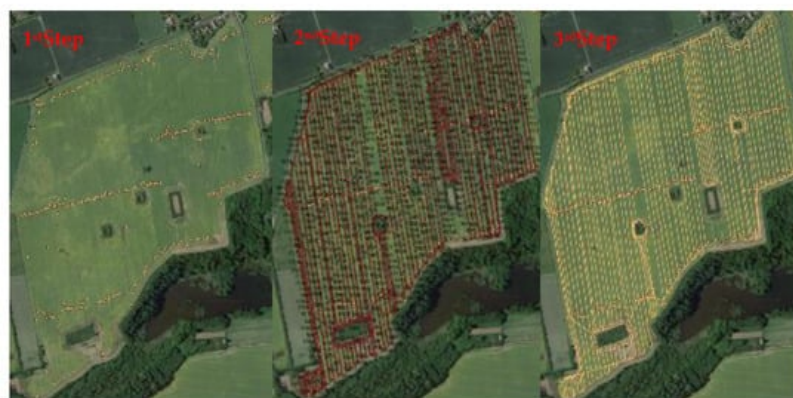
Figure 2. The steps for determining the driving distance in the sample field.

In order to validate the proposed method, the non-working traveled distance for the conventional method was calculated and compared with the solution derived from the proposed optimization algorithm. Therefore, the recorded log file for the sample field was analyzed to determine the total amount of non-working traveled distance. The amount of covered area in the conventional method is calculated by multiplying the total traveled distance by the baler into the working width of the baler ( 51,370.8 \times 10.5 ). The same procedure was applied to the optimization method to find the area covered ( 64,346 \times 10.5 ). The difference between the area covered in the conventional and optimized methods refers to the fact that in the conventional method the field was covered by two balers and the information corresponding to only one of them was available. However, in the optimized method, the entire field was covered by one baler. Dividing the total driven non-working distance by the amount of covered area shows the amount of non-working distance per hectare, which can be used later for comparison of the optimized and conventional methods. Table 1 demonstrates the comparison between optimized and conventional method.