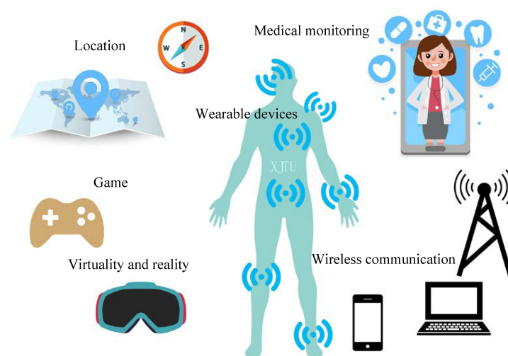
Figure 1. A Wireless Body Area Network (WBAN) and its applications [1][8][9][10][11][12][13][14][15][16].

Wearable antennas, as a vital component in WBAN systems, enable wireless communication with other devices on or off human bodies [17][18][19][20][21][22][23][24][25][26][27][28][29][30][31][32][33][34][35][36][37][38][39][40][41][42][43]. Compared to traditional antennas, the design of wearable antennas are facing many development bottlenecks: The electromagnetic coupling between the human body and the antenna, the varying physical deformations, the widely varying operating environments, and limitations of the fabrication process [27][28][29][30][31][32][33]. Further, the requirements for these wearable antennas include mechanical robustness, low-profile, lightweight, user comfort, fabrication simplicity [17][18][19][20][21][22][23][24], wideband [25][26], and multiband [20][27][29]. Thus, advanced design methods and techniques are urgently needed to