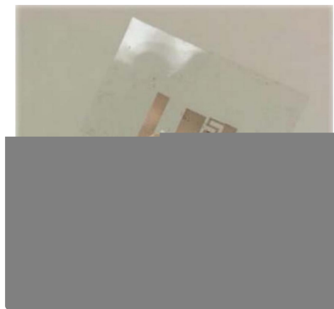
Figure 4. The photo of the mechanically reconfigurable electrically small antenna in [78]. The antenna made of flexible wire mesh and a frequency shift is generated in different stretch.

Besides that, Jang et al. proposed a method to fabricate a small semitransparent and stretchable antenna using a stretchable micromesh structure, as shown in Figure 4 [78]. This antenna consists of a 4.7 \mu\text{m} thick Cu mesh pattern and a PDMS layer as the substrate. The PDMS is flexible and optically transparent, and it can maintain the shape of a micromesh as well as protect the metal wire from mechanical damage when stretched. The increase in tensile strain reconfigures the resonant frequency of the antenna almost linearly from 2.46 to 2.94 GHz. However, this antenna suffers from low radiation efficiency due to the reduced surface currents flowing through the micromesh patch.