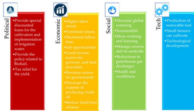
Figure 2. Political, economic, social, and tech (PEST) analysis.