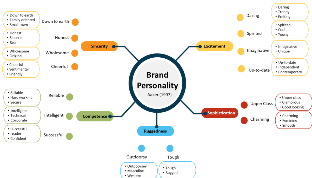
Figure 3. Brand personality model.

The model groups brand personalities into five broad categories, subdivided into personality traits and strengths, provided by several adjectives linked to each dimension (see Figure 3 ).