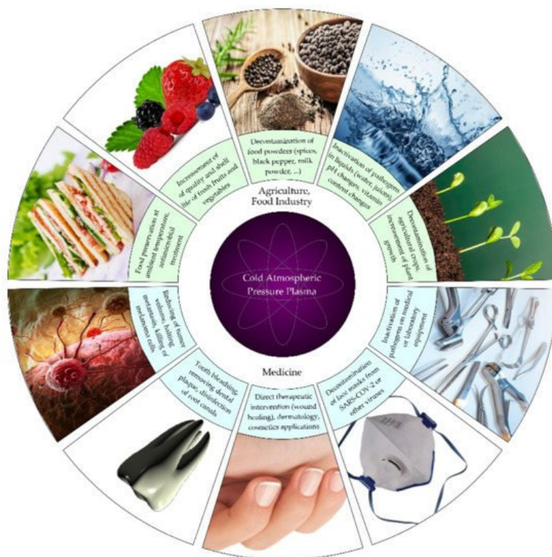
Figure 3. Schematic illustration of selected applications of CAPP treatment in medicine, agriculture and food industry.

Based on the above-mentioned properties, it can be said that plasma medicine holds enormous application and development potential (Figure 3) [47]. CAPP seems to be ready to enter the healthcare area for various medical therapies. However, a lot remains to be done (conduction and evaluation of preclinical and clinical trials with standardized protocols), in order to fully understand the interactions between plasma and biological cells and tissues (both in vitro and in vivo) [26] [49].