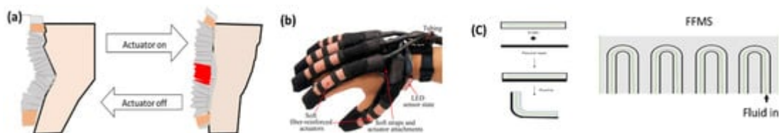
Figure 2. Applications of pneumatic/hydraulic actuators as wearable devices. (a) Pneumatic based wearable knee suit [14]. (b) A hydraulic soft glove for combined assistance and at-home rehabilitation [12]. (c) Fluidic Fabric Muscle Sheets (FFMS) [13].

A soft robotic glove based on a fluid-driven actuator demonstrated assistance in the grasping movement of the hand [12]. Different actuation modes for the thumb and the rest of the fingers were applied to achieve a typical grasping movement ( Figure 2 b). Inspired by sheet-like biological muscles, the Zhu group presented a new family of soft actuators, named Fluidic Fabric Muscle Sheets (FFMS) [13]. The elastic tubes were stitched into fabric to achieve actuation by the movement of fluid in and out. By the design of the fluid route, these actuators exhibit multiple deformation. Through the application of textile technology, this type of actuator can be made into a micro execution unit, or can be developed as a large, meter-level actuator. Data shows that this type of actuator can withstand a force of more than 150 n, which is more than 115 times its weight, and up to 100% engineering strain ( Figure 2 c).