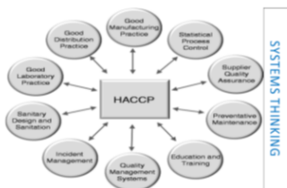
Figure 1. 'Prerequisite programs (PRPs) adapted from What is a Management System? Available online: https://images.app.goo.gl/Aqez5sSfpbvjQqmK7 (accessed 20 June 2021).

In September 2005, ISO incorporated Hazard Analysis and Critical Control Point (HACCP) principles for food safety into the ISO 22000 quality management system. In this way, there has been an integration of HACCP program and principles to quality management systems and prerequisite programs (PRPs) for the improvement of the quality and safety of the food chain in the food industry.