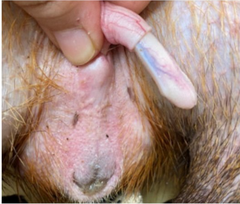
Figure 1. Penis showing lateral cartilage.

lateral penile cartilage was found on either side of the glans penis, while its ventral side was free [15] . These descriptions were similar to those of Menezes et al. [17] , who also found the presence of the dartos tunic, external and internal spermatic fasciae and cremaster muscle, upon removal of the skin.