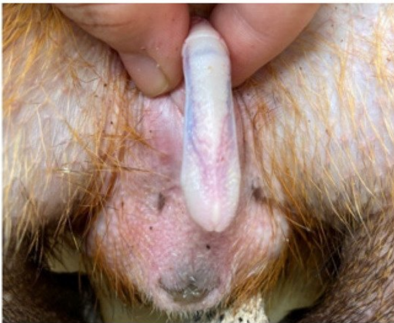
Figure 2. Dorsal view of penis.