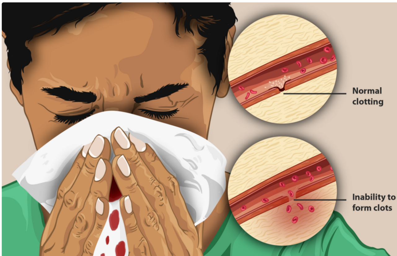
A woman with hemophilia.

Characteristic symptoms vary with severity. In general symptoms are internal or external bleeding episodes, which are called "bleeds". [1][2] People with more severe haemophilia experience more severe and more frequent bleeds, while people with mild haemophilia usually experience more minor symptoms except after surgery or serious trauma. In cases of moderate haemophilia symptoms are variable which manifest along a spectrum between severe and mild forms. [3]