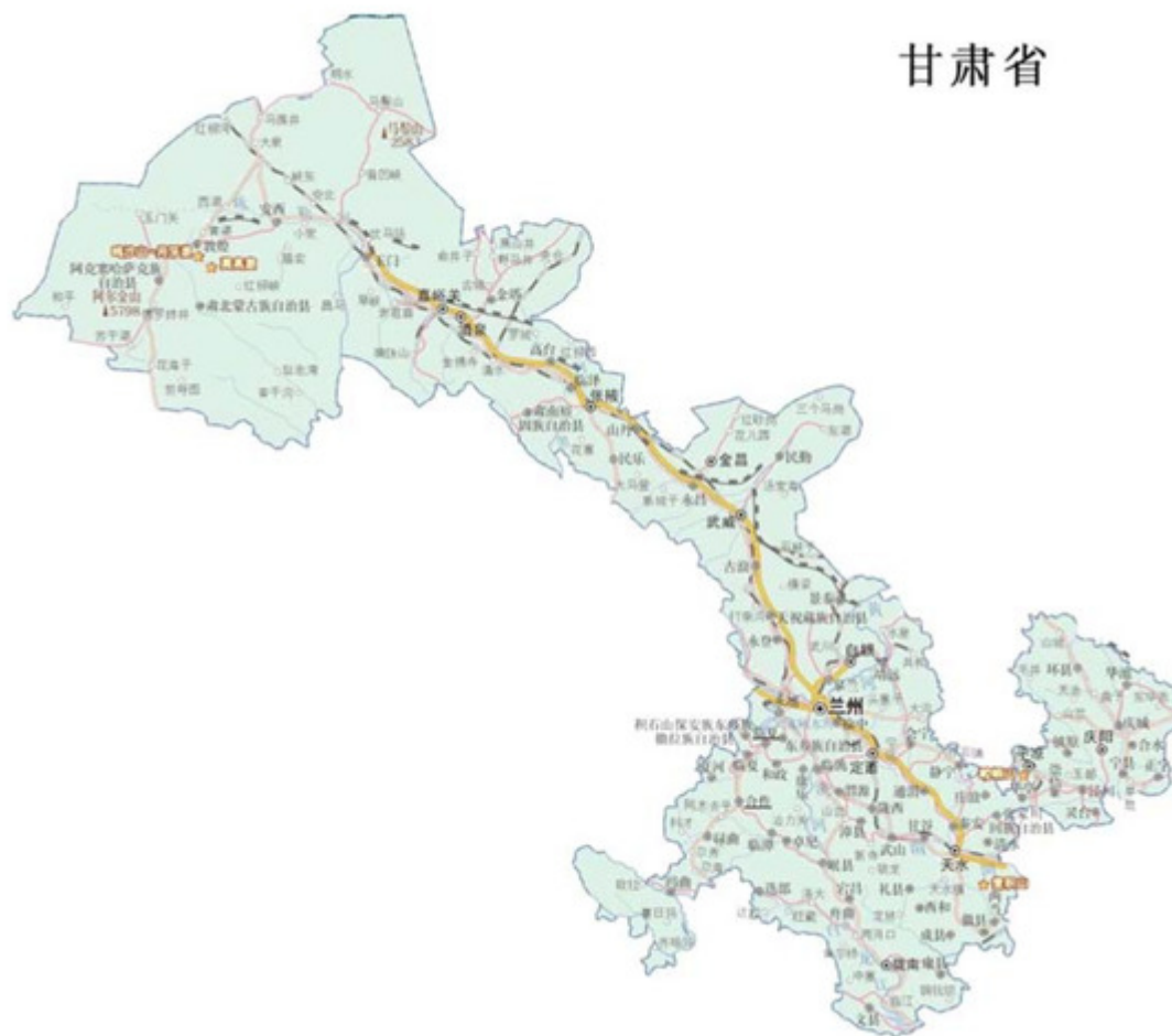
Figure 1. Gansu Province map. Note: This map is provided by http://www.gansu.gov.cn/col/col10/index.html , accessed on 3 February 2021.

However, as obvious as the above advantages are, its natural ecology is fragile, the economic development is lagging behind, and the living standard of peasant farmers is low (e.g., the per capita GDP ranking of Gansu Province in China is 31/31 ( http://www.gov.cn/shuju/chaxun/index.htm , accessed on 3 February 2021.)). Hence, determining how to carry out RCHP in the complex human and geographical environment, while taking into account the regional political and economic characteristics, is the core of RCHP in rural Gansu.