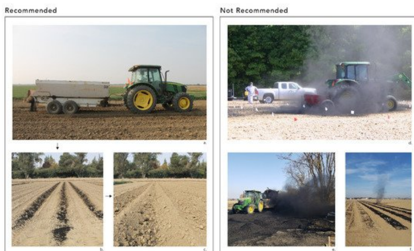
Figure 3. Practices that are recommended (left) and not recommended (right) for the application of biochar to agricultural lands. On the left, a biochar is applied to the field at 40% moisture content (a), using a subsurface banding technique (b) in which biochar is immediately covered by soil (c) so it is less likely to contaminate air or water as the result of wind- or rain-driven erosion. On the right, a biochar is applied at 0% moisture content (d), on a windy day (e), and left on the soil surface

Major (2010) summarizes various biochar application methods and recommends combining biochar amendment with other on-farm processes to reduce costs and to minimize the potential for dust emissions [23]. Suggestions include adding biochar to compost or liquid fertilizer. To reduce dust emissions, recommendations for applying biochar with high moisture content or in liquid slurries are common, as are warnings to avoid application on windy days [159][187][188]. While most biochar field trials utilize a broadcasting application technique (Figure 3d), Major (2010) suggests that subsurface banding (Figure 3a–c) may have the greatest potential to reduce wind and rain-driven biochar losses. Regardless of application method, the use of appropriate respirators, eye protection, gloves, long sleeves, and pants is recommended for farm operators and workers while handling biochar [189].