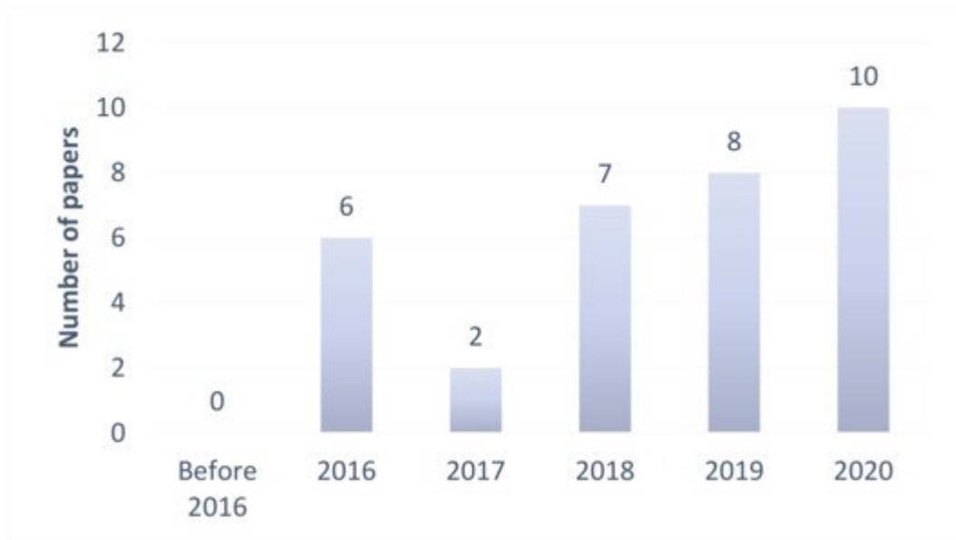
Figure 2. Previous studies on deep learning-based methods for heart sounds classification.

learning in the field. To the best of our knowledge, this is the first review report that consolidates the findings on deep learning technologies for heart sounds classification.