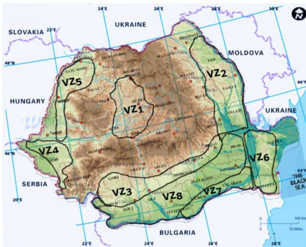
Figure 1. Viticultural zones in Romania.

1), Moldavian Hills (VZ 2), Muntenia and Oltenia Hills (VZ 3), Banat Hills (VZ 4), Crișana and Maramureș Hills (VZ 5), Dobrogea Hills (VZ 6), Danube Terraces (VZ 7), sands and other suitable terrains from the South (VZ 8) [30][33].